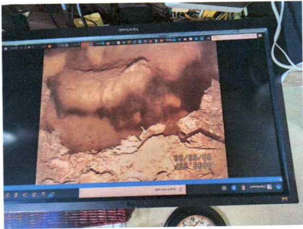
Old Well Casing