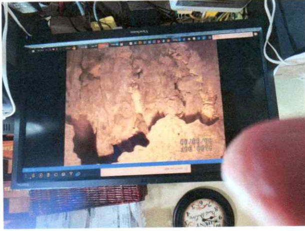
Well casing repair